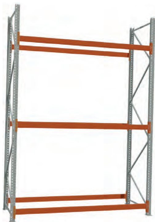
starter bay 2 end frames & beams